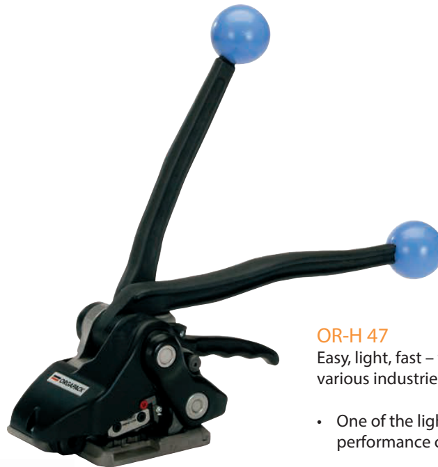
OR-H 47 Easy, light, fast – for use in various industries