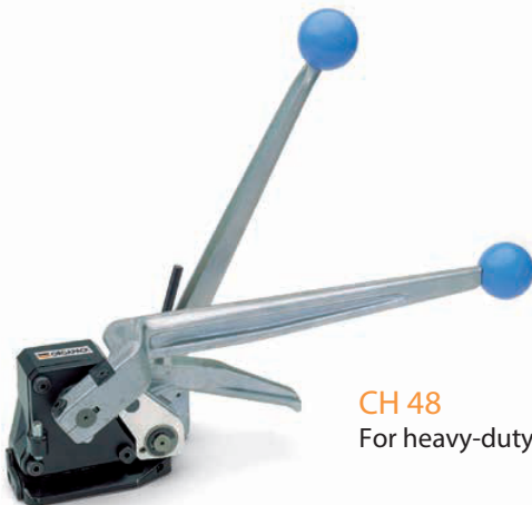
CH 48 For heavy-duty applications